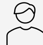
Project Manager Solar & Green Hydrogen Developer, Spain

“We’ve been using our Excel which takes 40min to run each simulation while this is done in seconds with SOREN.”