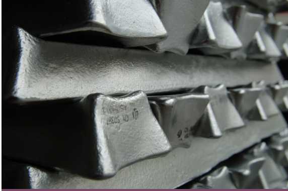
For all product qualities