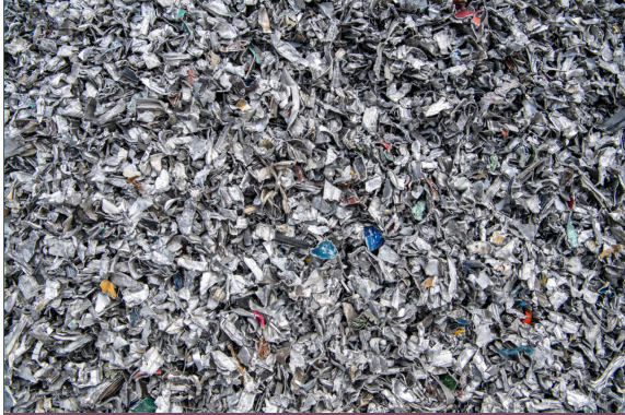
For all raw material qualities