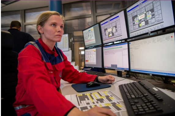
During all operating modes